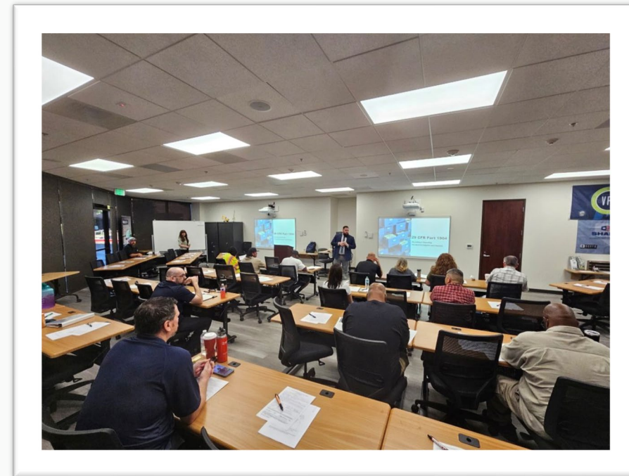
SCATS' Training Center