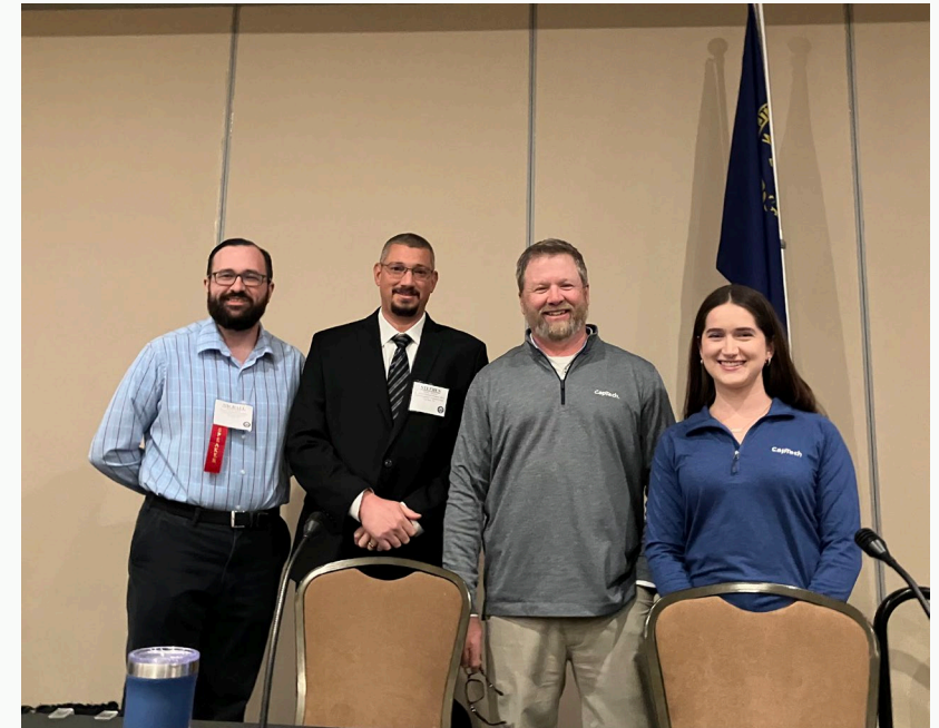
Staff from DIR and CapTech discussed upcoming CARDS enhancements with stakeholders at the 11th Annual Nevada Workers' Compensation Educational Conference.