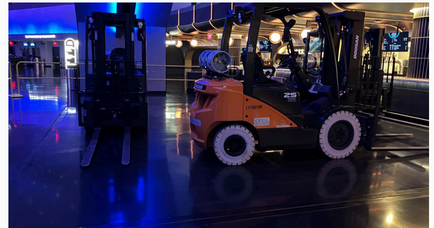
Lift at MSG Sphere